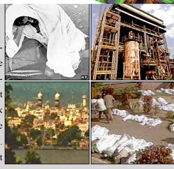
Pesticide plant in Bhopal city and the victims

Bhopal Gas Tragedy is one of the world's worst industrial disaster. The unfortunate event occurred around the midnight of December 2 and 3, 1984 at the Union Carbide Limited (UCIL) India pesticide plant in Bhopal, Madhya Pradesh, India. There was a leak of Methyl Isocyanate (MIC) gas and other toxins from the plant, resulting in the exposure of over 500,000 people. The estimated death toll vary according to different source. The official immediate death toll was 2,259 and