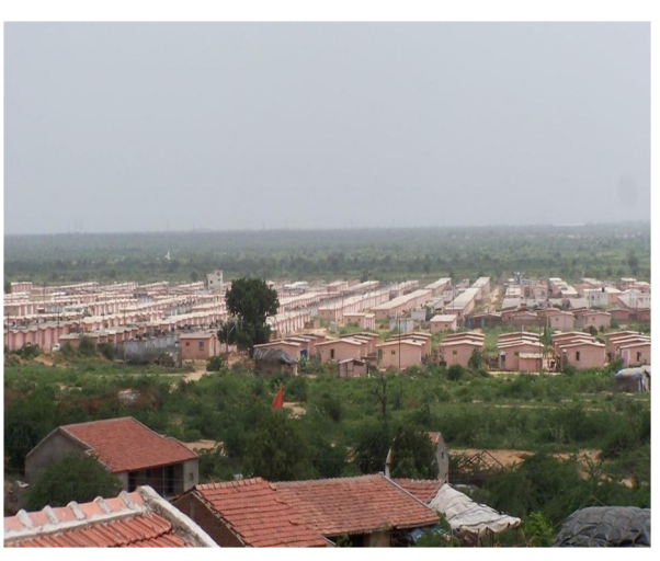
A relocated village in Bhuj, Gujarat

As we have been reporting in the previous issues, the study on the recovery status after Gujarat earthquake has come to the final stage and we have submitted the final report along with case studies to ADRC/IRP, after incorporating comments and suggestions from different stake holders through a state level consultation workshop. The report is under final review before publication. We are looking forward for this report with a hope that this report will surely make significant contributions in managing future disasters.